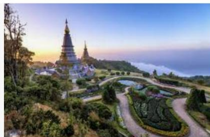
Is Chiang Mai in Thailand Safe? 6 ... worldnomads.com