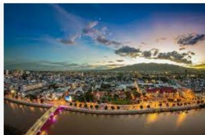
Chiang Mai | Thailand | Britannica britannica.com