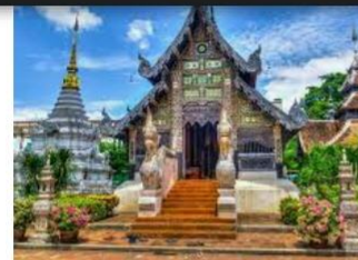
10 Chiang Mai Travel Tips to Avoid ... theinvisibletourist.com