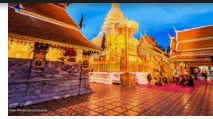
Chiang Mai - Everything You Need to ... chiangmai.bangkok.com