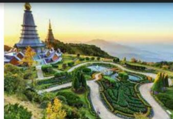
48 Hours in Chiang Mai: What to Do a... tripsavvy.com