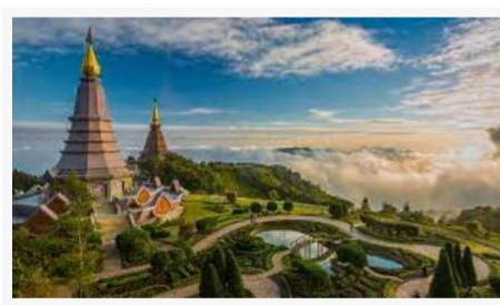
Chiang Mai - Everything You Need to ... chiangmai.bangkok.com