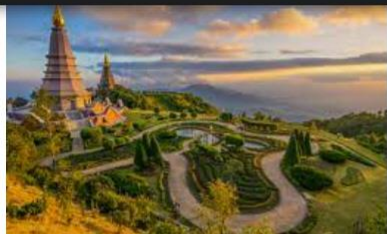
Chiang Mai travel | Thailand, Asia ... lonelyplanet.com