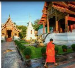
Chiang Mai, Thailand, guide... theguardian.com