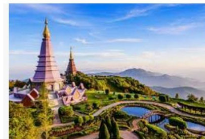
The Best Travel Guide to Chiang Mai arrivalguides.com